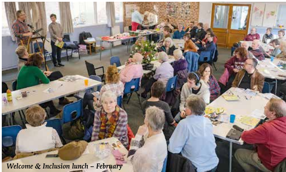
Welcome & Inclusion lunch – February