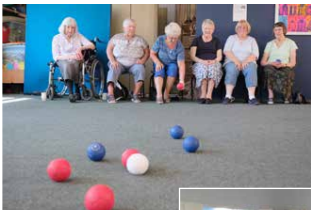
Joyful Connections Café

As a church we continue to engage and connect with our community in many ways. This year we have taken time to build and nurture the connections we made and established in 2017. Our hope is that we continue to grow God's Kingdom here in the parish of St Luke's and create connections for people to be able to experience the unconditional love of God for all of His creation.